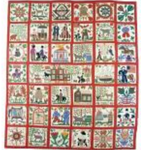
IQSC, UNL Album "Reconciliation Quilt" (1987) 2001.011.0001

Family membership's include all the benefits of Individual Memberships for two adults, as well as free Museum admission for their children or grandchildren under age 18 and advance e-notice and free admission to family programs. All memberships run for 12 months from receipt of payment. Without a membership, daily Museum admission fees alone are $5 for an adult, $3 for a child, and $10 for a family.