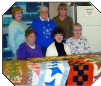
Table Runner Class Offered