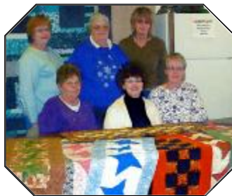
Table Runner Class Offered